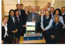
PARENTS LOUNGE OPENS AT RCH PAGE 04