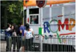
ROMPING AROUND MELBOURNE PAGE 02